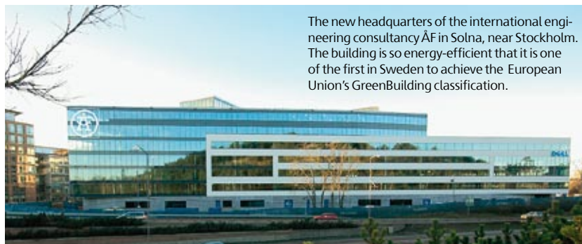
The new headquarters of the international engineering consultancy ÅF in Solna, near Stockholm. The building is so energy-efficient that it is one of the first in Sweden to achieve the European Union's GreenBuilding classification.

Skanska Xchange – a pan-Nordic development project aimed at reducing the costs of residential construction – is launching a number of pilot projects in the Nordic countries.