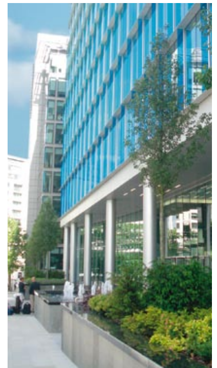
One Kingdom Street at Paddington-Central in London utilizes both geothermal heat and solar panels to reduce its climate impact.